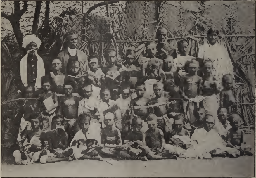
HINDU DAY SCHOOL AT KOCHADAI

Again we turn from the filth and turmoil of the street into a doorway and pass through to a space filled with building material. Native Christian workers as well as members of the missionary circle are gathered with a large representation of children who are attendants at the West Gate day